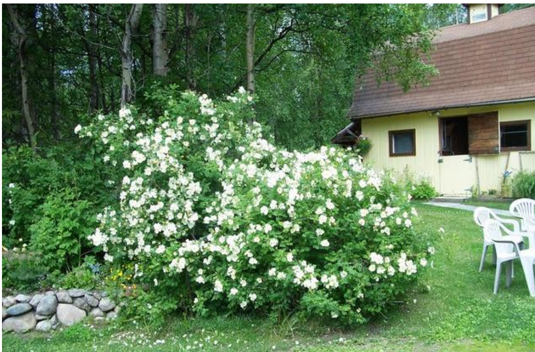
This Scotch rose is performing its function as a buffer between the woodland and the lawn area.

It's nice to have a plant which requires so little care, and the peasant has a particular liking for this one. Perhaps the best availability is to acquire side shoots from a friend who grows this plant. It is easiest to control in a lawn area where side shoots can be cut down with the grass. Thanks, folks.